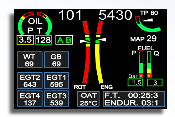
Main screen helicopter version

All data are recorded and stored in memory for over 200 hours of recording. The data can be viewed directly on the display or downloaded for viewing and archiving on a PC.